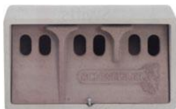
Woodcrete Sparrow terrace