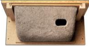
Swift Box Ideal for buildings