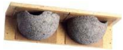
Schwegler House martin nest boxes. Sturdy woodcrete construction