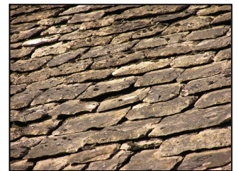
Bat roost site under roof tiles