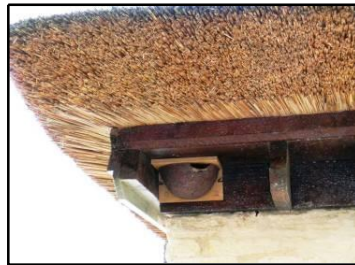
House martin nests at Lower Mill Estate, Gloucestershire.