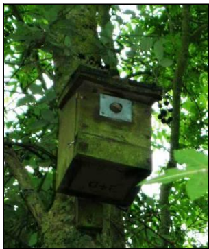
Traditional bird box