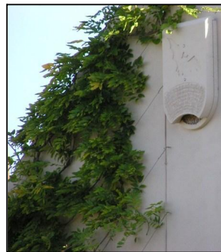
Green wall created using fixing wires